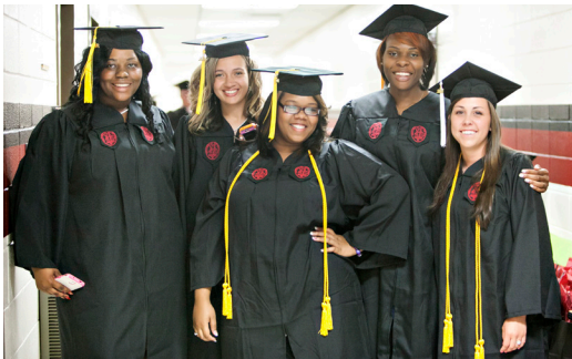
Commencement represents moving to the next life phase, whether that means staying at USC Sumter or transferring to another campus.

Although for some Commencement signals the end of the academic year, it is also a reminder of how hard students work to achieve their goals and move forward.